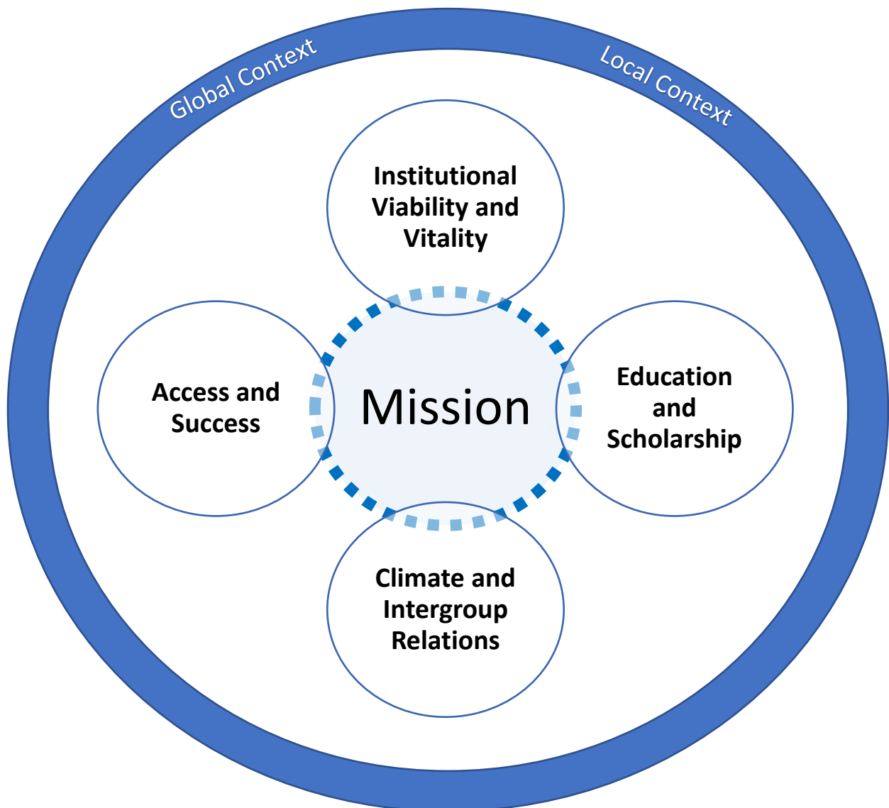
Adapted Figure of Smith’s (2015) Diversity Framework for Understanding what Institutional Capacity for Diversity Might Mean or Look Like