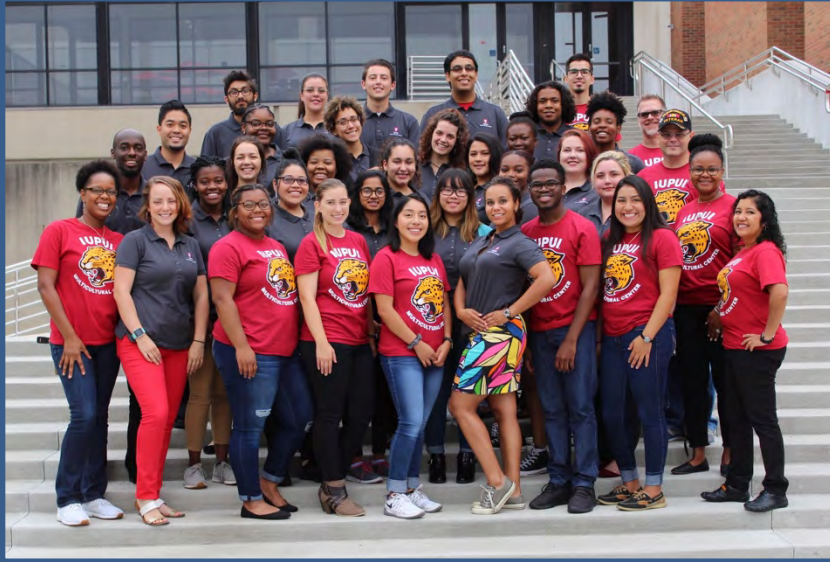
The IUPUI Multicultural Center team is proud to support the campus community promoting the value of diversity, broadening multicultural awareness and sensitivity, advancing cultural competence, and encouraging cross-cultural collaborative relationships through retention, engagement and education.